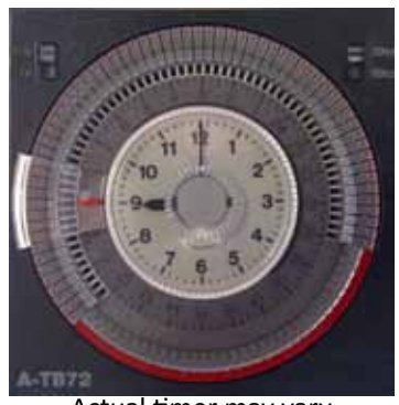
Actual timer may vary