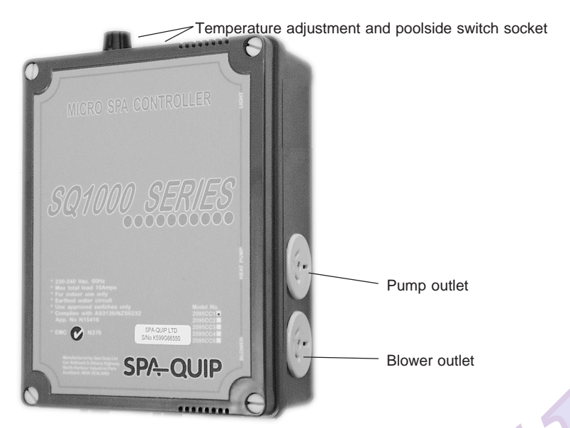
Fig 1: SQ Series 2 button controllers

The SQ series heat pump and control system has been designed so the pool can be operated automatically, maintaining pre-determined heat and filtering operations.