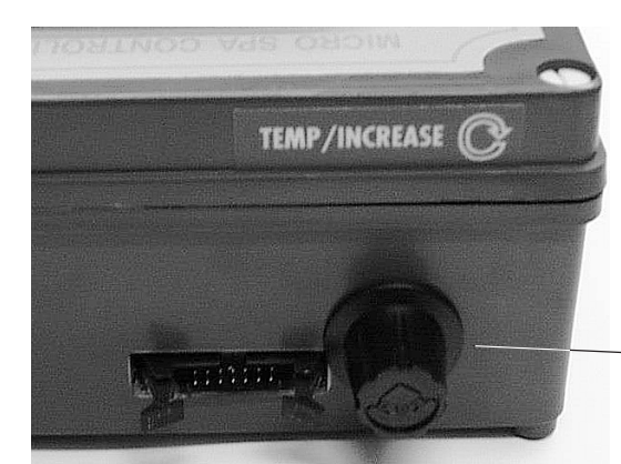
Fig 4: Temperature control knob